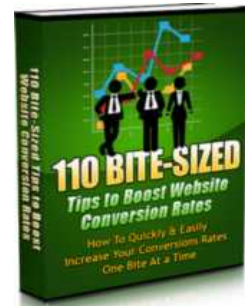
110 Bite-Sized Tips To Boost Website Conversion Rates

Writing killer E-Mails is an essential survival skill in Internet Marketing. If you don't develop the skill, you won't be able to survive. Invest in learning this priceless skill now and guarantee your future success!