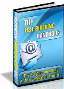
The List Building Handbook

Over 300 powerful tips, tricks and tactics from A-Z to help you build an Internet Empire!